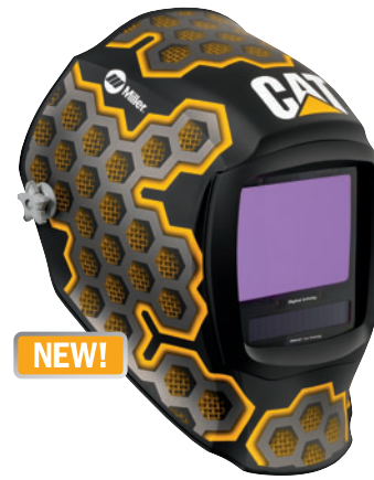
CAT Cat® 2nd Edition 282007