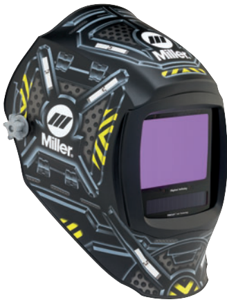
Black Ops™ 280047