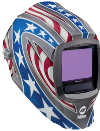
Stars and Stripes™ 280049